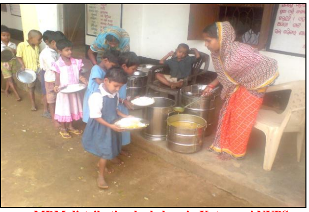
MDM distribution by helper in Katyayani NUPS, by A.P. Foundation at Puri Dist.