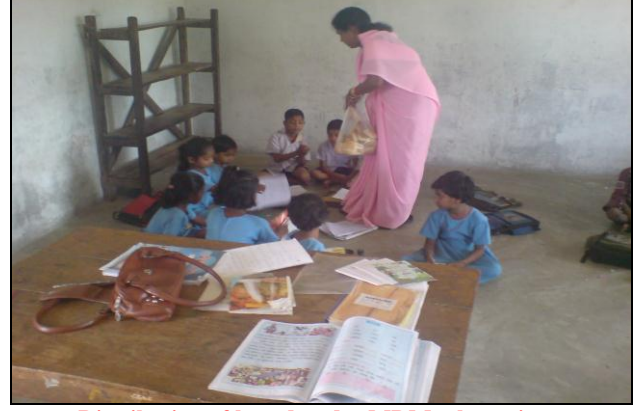
Distribution of bread under MDM scheme in Tulasipur UPS, Cuttack Dist.