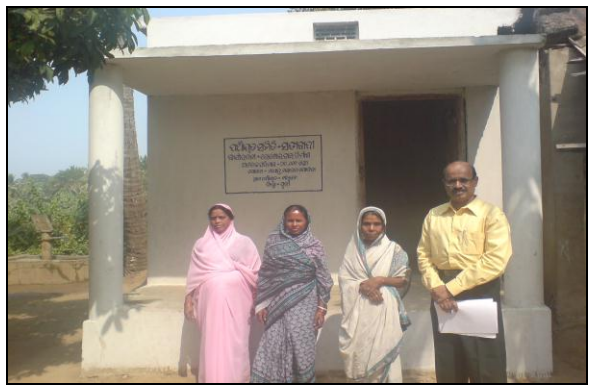
Kithen constructed under MDM scheme in Madhuban UGUPS, Puri District