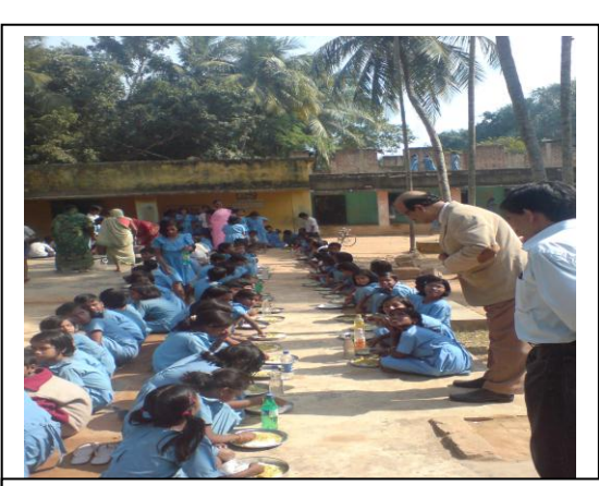
Social equity seen among children during MDM in consumption in Alaidiha Nodal UPS, Khordha