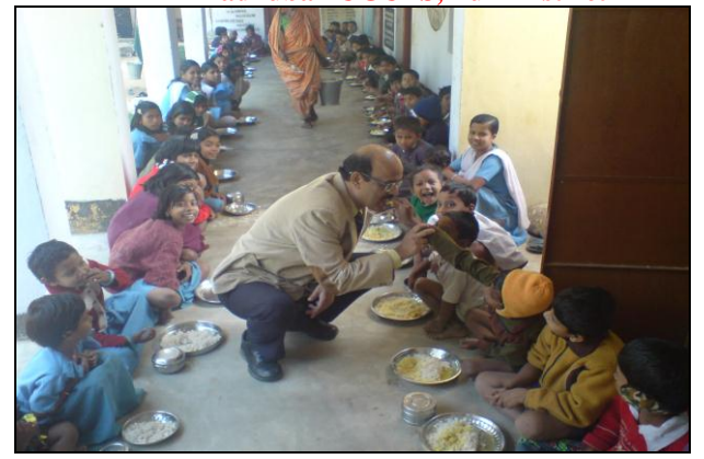
MDM tasted by Nodal officer at Narasinghprasad PUPS, Nayagarh Dist.